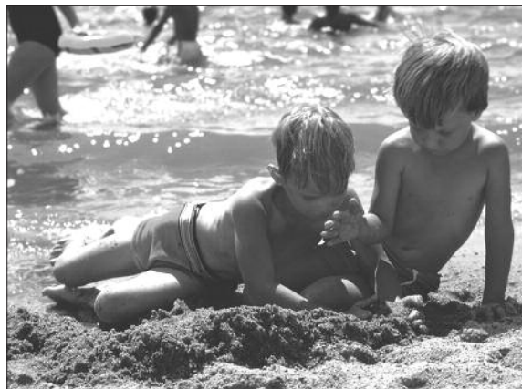
Research has shown that the chemical ingredients in some popular sunscreens are playing havoc with our health.

Avobenzone(aka Butyl-Methdiebenzoylmethane) – This is also listed as a UV filter. This chemical breaks down under the exposure of sunlight so it is commonly mixed with Oxybenzone to try to slow the rate at which it degrades. This has been listed as a known carcinogen because it breaks down into free radicals when it is exposed to sun. The FDA has stated that as long as it is under 3% then it is allowable. This chemical is rated mild for health concerns but long term or heavy usage as a high carcinogen.